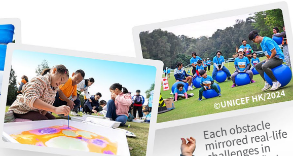
Each obstacle mirrored real-life challenges in children's first 7,000 days of life.