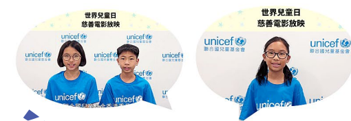
Video featuring Junior DJs of UNICEF HK 'for every child, we listen' programme was played before movie screening.

Supported by UNICEF HK, Emperor Cinema held a series of charity movie screenings to raise awareness of child rights. Over 2,000 free tickets were given out to underprivileged children and their parents and caretakers.