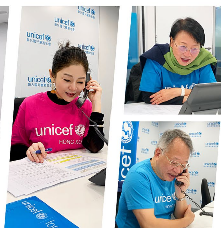
UNICEF HK organised Thankathon 2025 to express sincere gratitude to supporters in person.