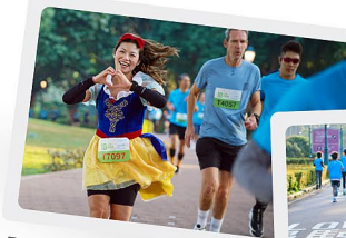
Runners rallied for good health and wellbeing of every child.