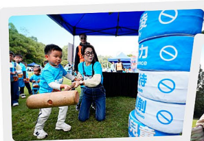
Families bonded over workshops and game stalls at the Fanling Golf Course.